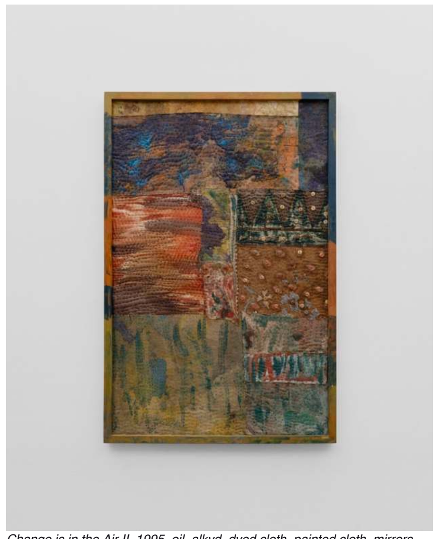
Change is in the Air II, 1995, oil, alkyd, dyed cloth, painted cloth, mirrors, and buttons stitched on canvas, 47 \times 30 inches.