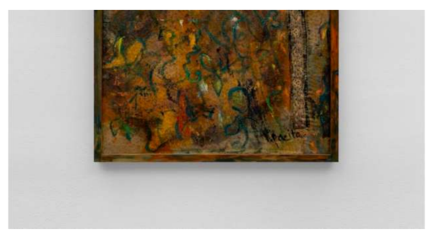
Change is in the Air IV, 1995, oil, alkyd, dyed cloth, and painted cloth stitched on canvas, 47 \times 30 inches.