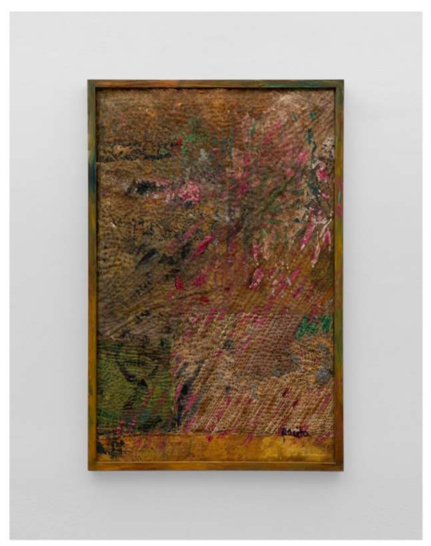
Change is in the Air V, 1995, oil, alkyd, and painted cloth stitched on canvas, 47 \times 30 inches.