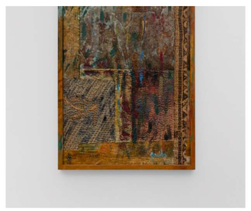
Change is in the Air I, 1995, oil, alkyd, dyed cloth, and painted cloth stitched on canvas, 47 × 30 inches.