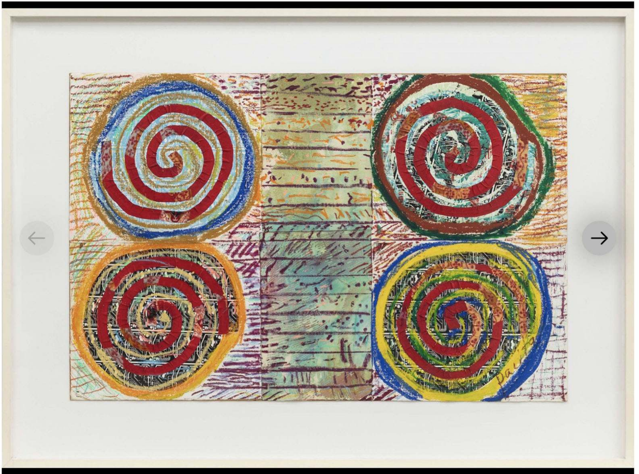
PHOTO 1 OF 6 Pacita Abad, 'Circles Bring You Happiness, acrylic, painted printed paper, painted cloth collaged on board 2004

Abad participated in numerous group exhibitions during her active period in the international art scene, including: Beyond the Border: Art by Recent Immigrant , Bronx Museum of the Arts, New York; Asia/America: Identities in Contemporary Asian American Art , a travelling exhibition organised by the Asia Society, New York; Olympiad of Art, National Museum of Modern Art, Seoul, Korea; 2nd Asian Art Show, Fukuoka Art Museum, Fukuoka, Japan; and La Bienal de Habana, Havana, Cuba.