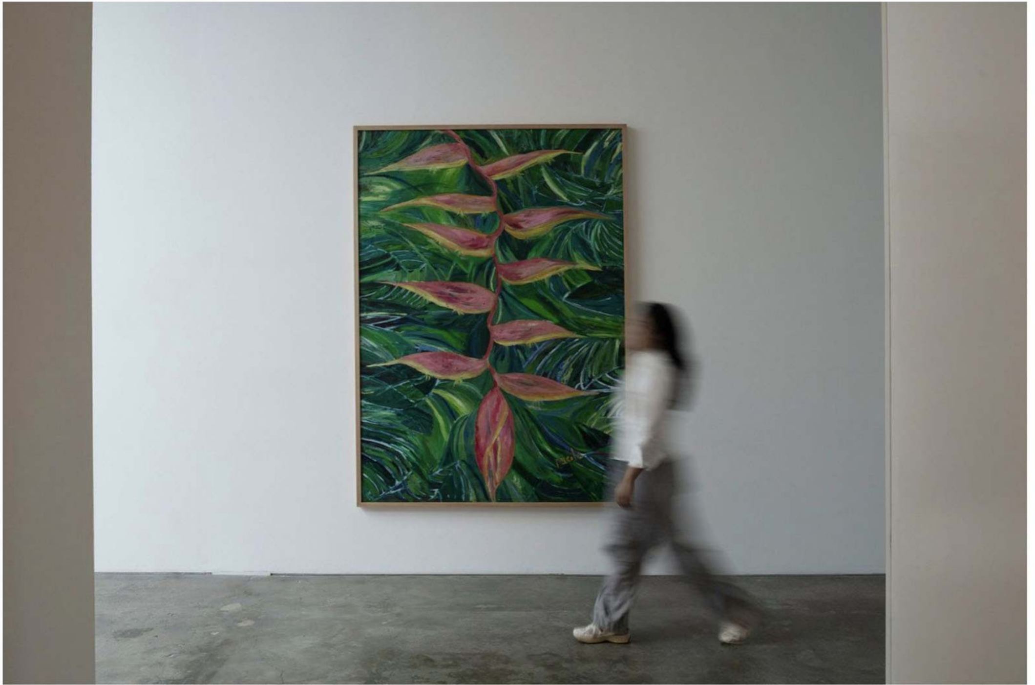
ABOVE Pacita Abad's 'Tropical Heliconia'

Marked by vivid colours and intricate materials, Abad's expansive paintings span a broad spectrum of themes, drawn in form and concept from several ethnic traditions of craft and thought. From portraying tribal masks and social scenes to intricate underwater landscapes and abstract forms, Abad's work transcended borders.