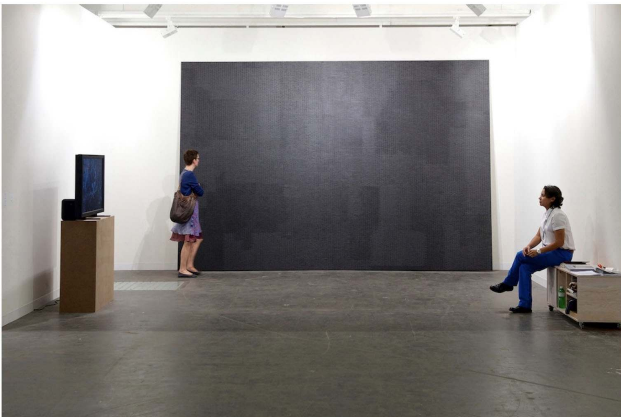
"Figure Study," Taniguchi's most recent show at Silverlens New York.

Dumaguete-born artist Taniguchi is known for her multidisciplinary work that encompasses painting, sculpture, video, and installation. She is most known for her ongoing series of brick paintings, most of them reaching meters in size and all displaying seemingly endless stacks of black rectangles painstakingly painted and outlined by hand.