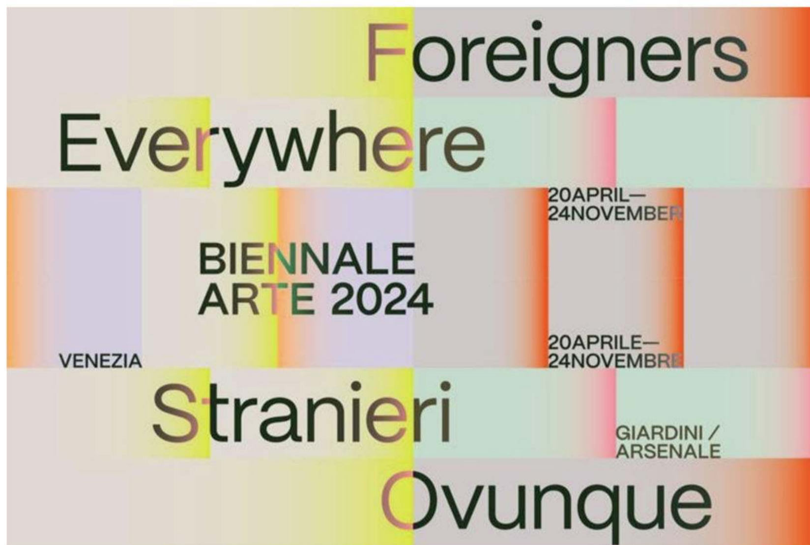
Poster from Venice Biennale website

The 60th International Art Exhibition of La Biennale di Venezia said in a statement that it will focus on artists who are themselves foreigners, immigrants, expatriates, diasporic, émigrés, exiled, and refugees—especially those who have moved between the Global South and the Global North.