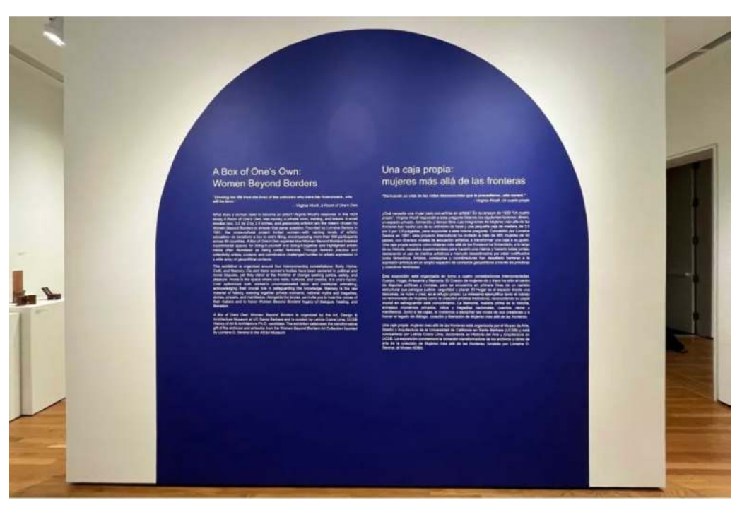
"A Box of One's Own: Women Beyond Borders," installation view, Art, Design & Architecture Museum, UC Santa Barbara

A Box of One's Own: Women Beyond Borders will be on view at the Art, Design & Architecture Museum until May 5. The Museum is open Wednesday to Sunday from noon to 5 pm.