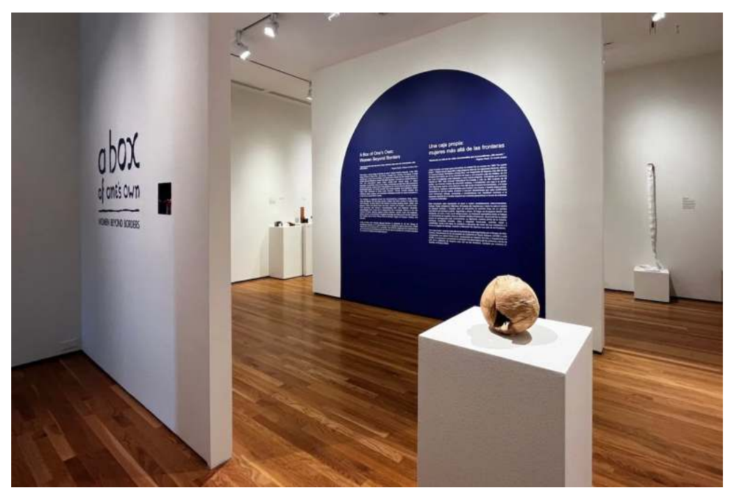
"A Box of One's Own: Women Beyond Borders," installation view, Art, Design & Architecture Museum, UC Santa Barbara

This article was originally published in UCSB's 'The Current'.