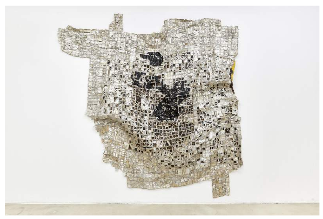
El Anatsui, Tse , 2016; bottle caps.

prestigious private collections across the region. This rare assemblage provides an unprecedented opportunity for art enthusiasts and the public alike to engage intimately with an array of mediums such as paintings, photography, sculptures, moving images, textiles, installations, and performance art.