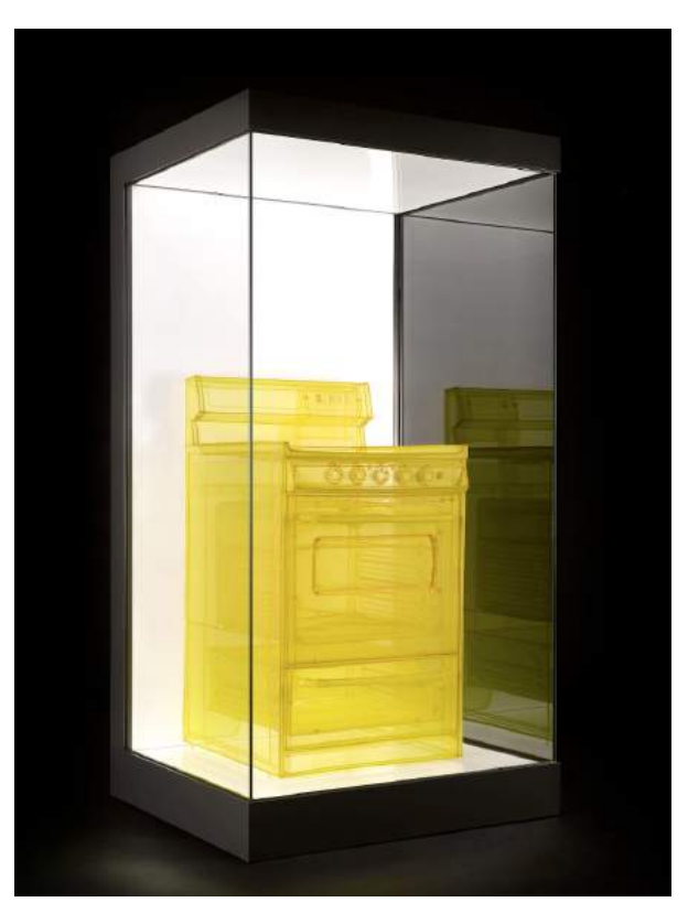
Do Ho Suh, Stove, Unit 2, 348 West 22nd Street, New York, NY 10011, USA , 2015; polyester fabric, stainless steel wire and glass display case with LED lighting.